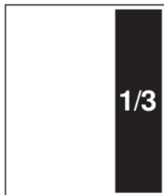
3/9 (1/3) of a page (2-1/2" w x 9-3/4" h) $125