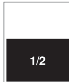
1/2 of a page (7-1/2" w x 5" h) $150

Please return this form along with your ad file and payment to: